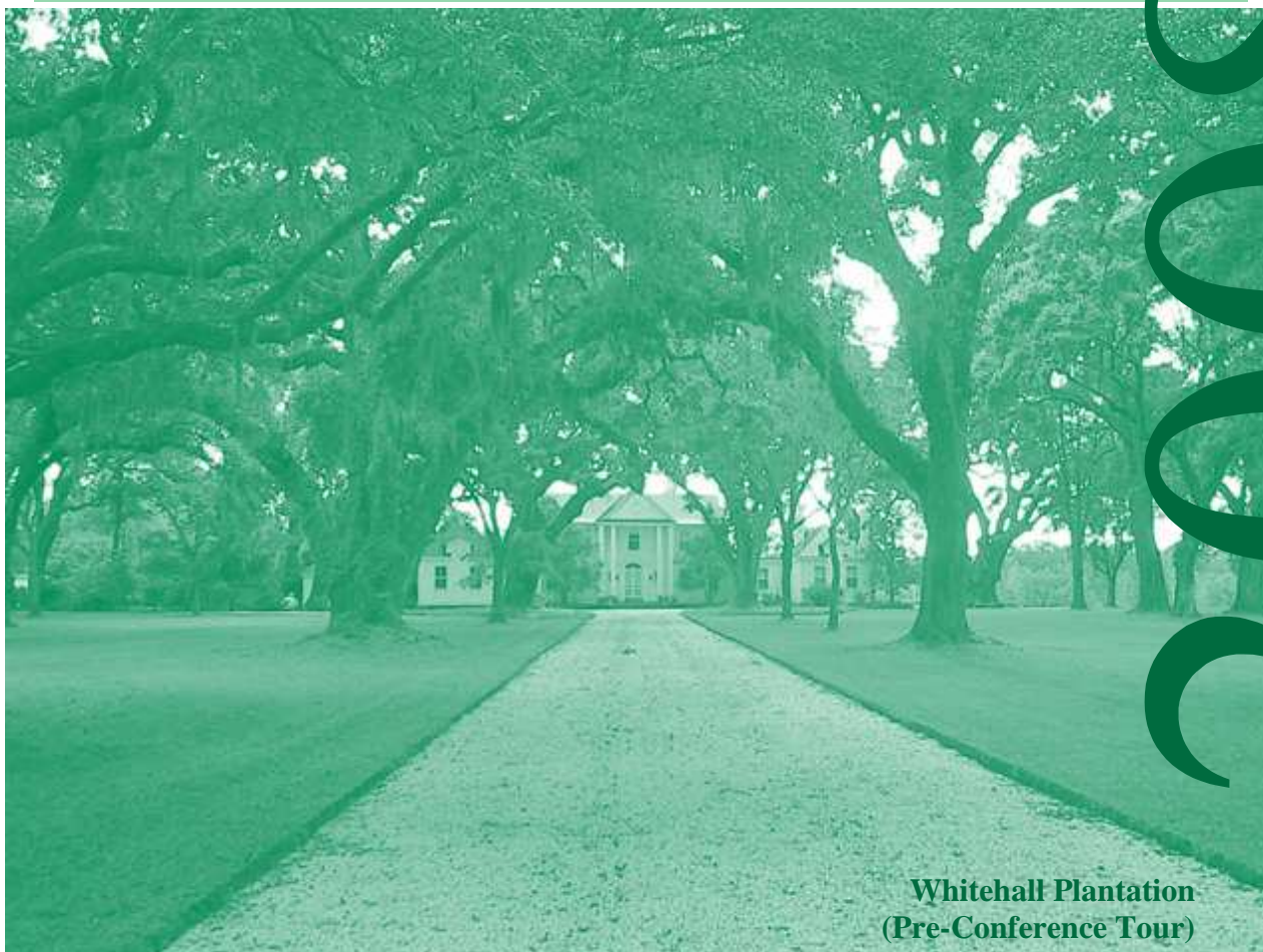
Whitehall Plantation (Pre-Conference Tour)