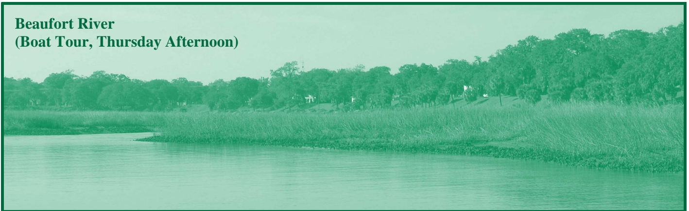
Beaufort River (Boat Tour, Thursday Afternoon)

The cost is $65 per person and includes transportation, lunch, admission costs, cocktails, & dinner. This event is limited to 50 people, so please register early to reserve your spot!